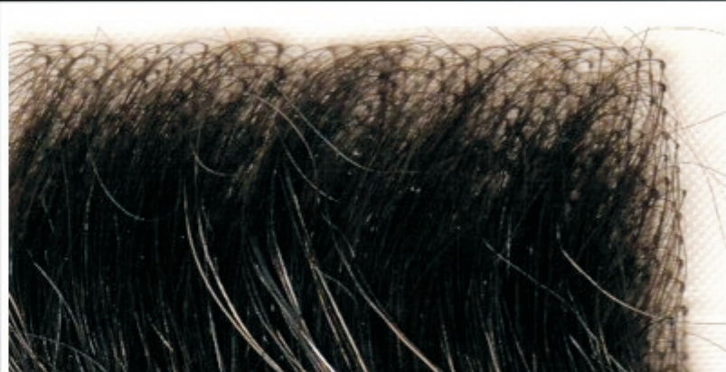
Medium Light to Medium